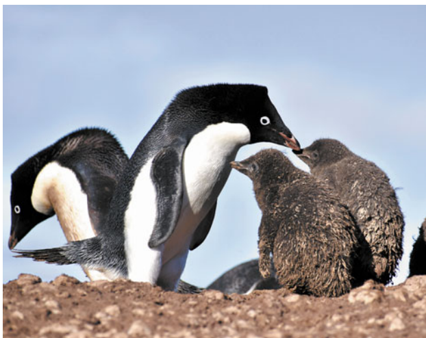
Fig. 1. Two normal-coloured Adélie penguins with the traditional black and white countershading standing next to two normal-coloured (although muddy), downy Adélie chicks.