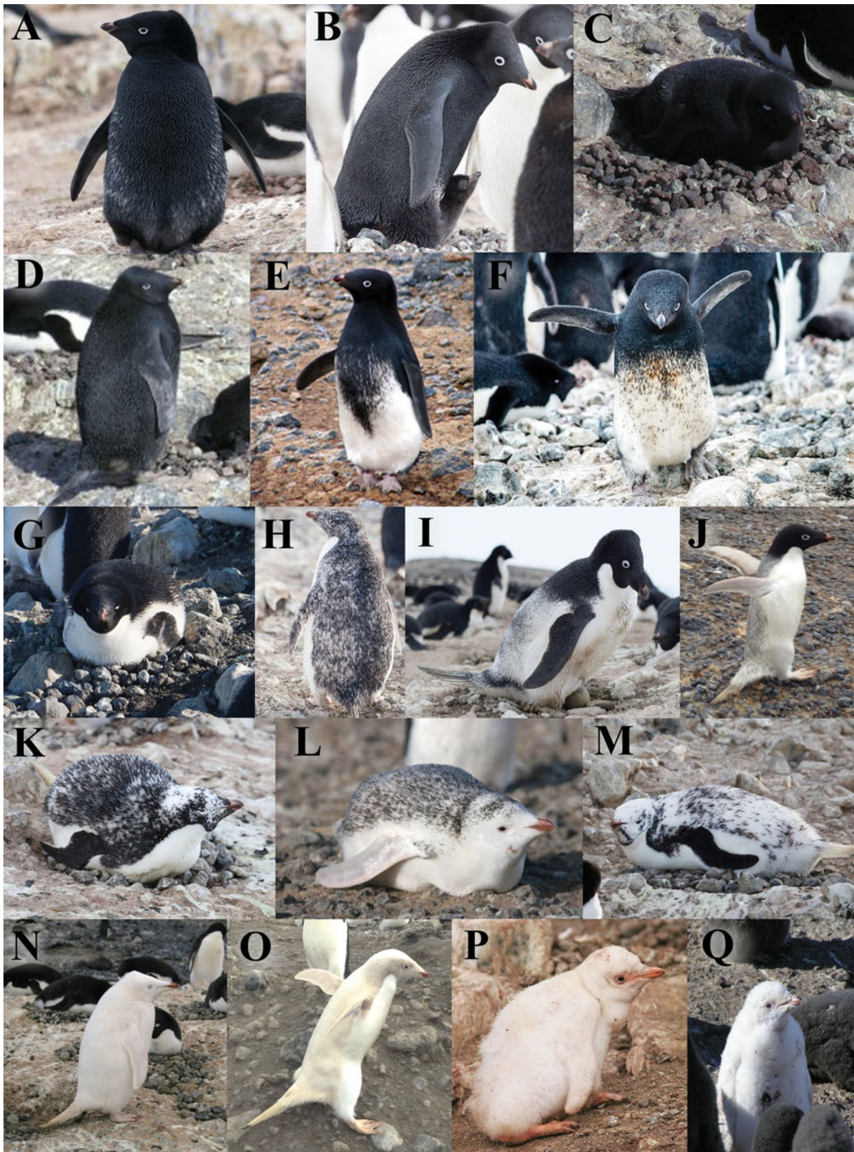
Fig. 5. Photographs of select colour-aberrant Adélie penguins seen in previous seasons at Cape Crozier, Ross Island, Antarctica: a.–f. partially or fully melanistic; g. partially leucistic; h.–m. progressive greying; n. ino light; o. ino dark; p. & q. ino chicks.