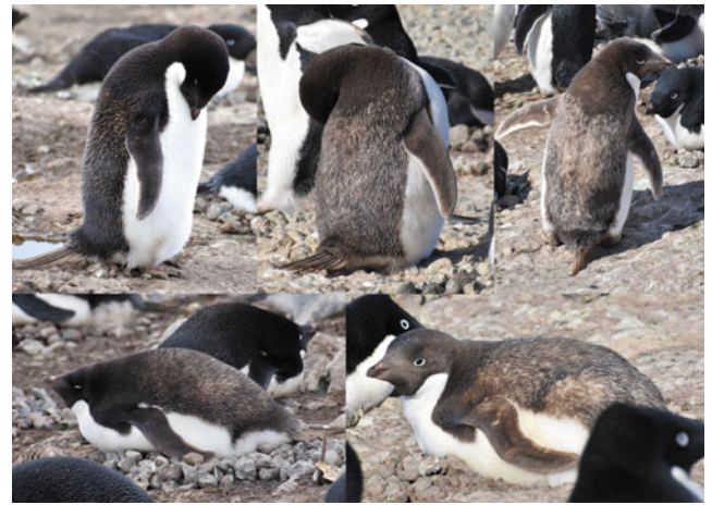
Fig. 4. A selection of Adélie penguins at Cape Crozier, Ross Island, Antarctica, exhibiting different shades of dark brown colouration with varying degrees of feather bleaching limited to the lower dorsal region.